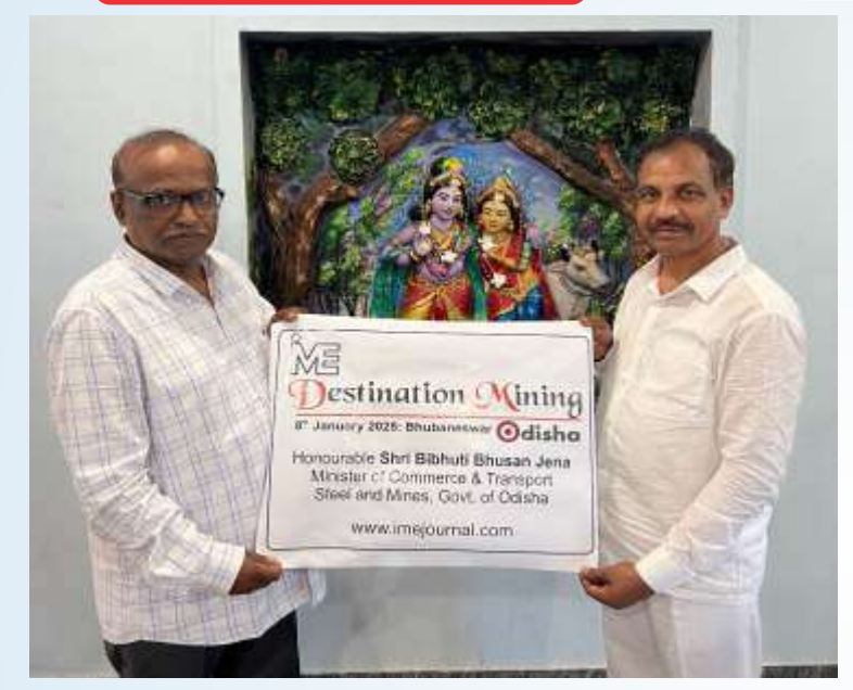
Honourable Minister Commerce, Transport, Steel & Mines Shri Bibuti Bhushan Jena launched the logo.

The then Honourable Governor of Jharkhand Draupadi Murmu was Chief Guest at our National Workshop on Safety Management of Mining Machinery, 23-24 June 2018